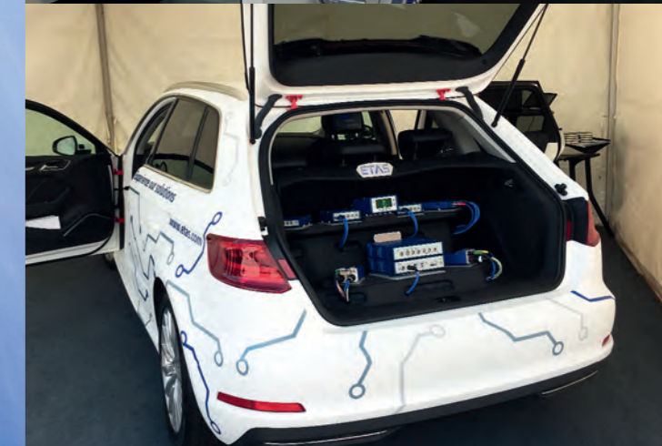
ETAS UK participated together with Bosch in the Genex Low Carbon Vehicle Event in Millbrook, United Kingdom. ETAS Demo Car, equipped with INCA-TOUCH and ETAS hardware, was again a highlight.