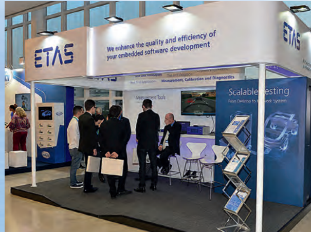
ETAS Brazil participated in the International Symposium of Automotive Engineering (SIMEA) in São Paulo. Focus topics: Scalable testing – from desktop to network system, measurement tools.