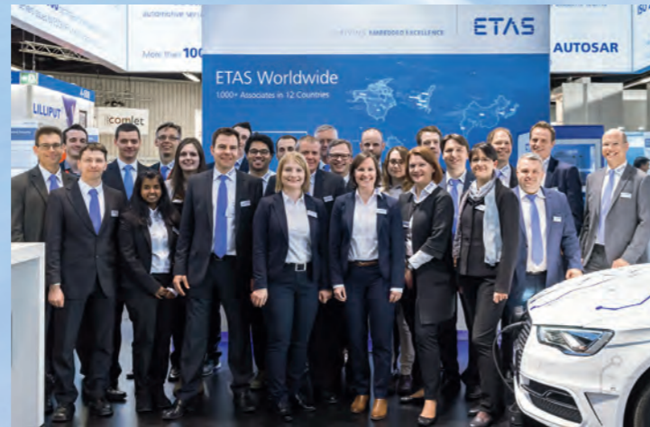
ETAS and ESCRYPT presented solutions for software development as well as safety and security at embedded world in Nuremberg, Germany. ETAS Demo Car, equipped with INCA-TOUCH and ETAS hardware, was a highlight.