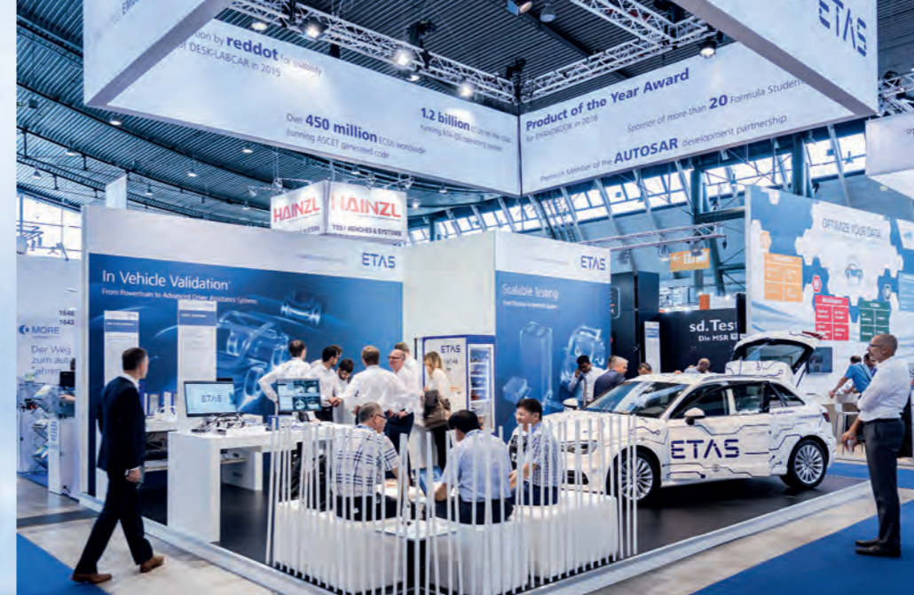
ETAS booth at the Automotive Testing Expo 2017 in Stuttgart, Germany, with a focus on scalable testing – from desktop to network system, measurement, and validation.